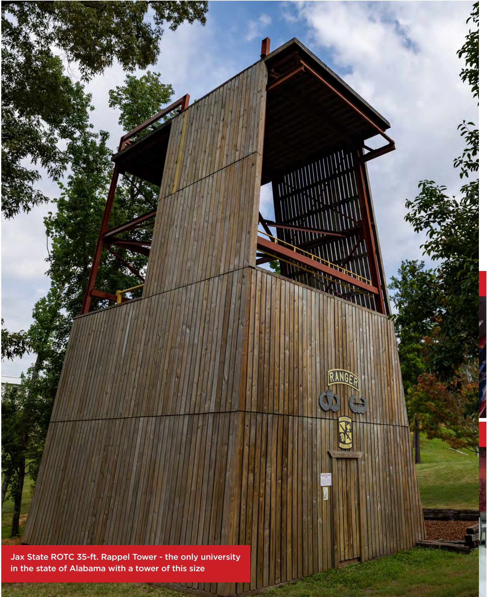
Jax State ROTC 35-ft. Rappel Tower - the only university in the state of Alabama with a tower of this size