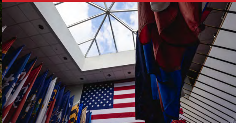
Rowe Hall Main Entryway - $500,000 Investment