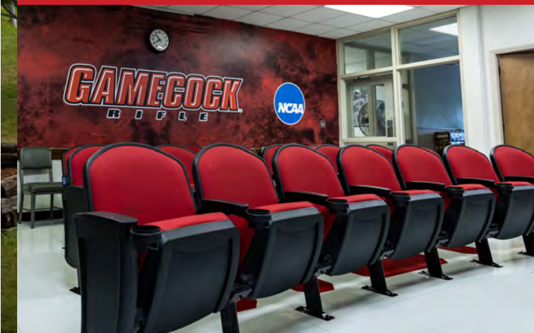
Rowe Hall Classrooms (3) - $100,000 Investment TAKEN (1)