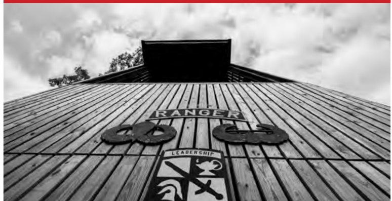
ROTC Rappel Tower - $50,000 Investment