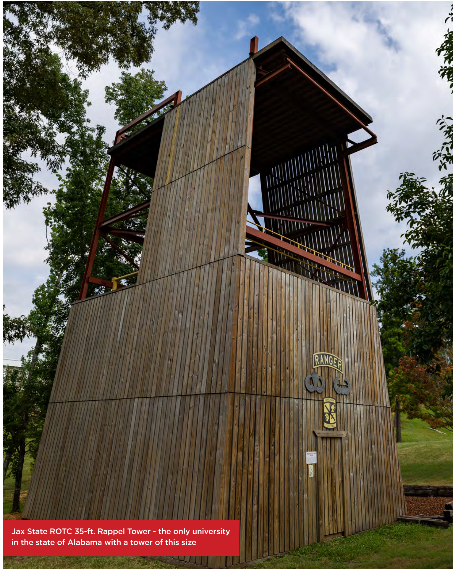
Jax State ROTC 35-ft. Rappel Tower - the only university in the state of Alabama with a tower of this size