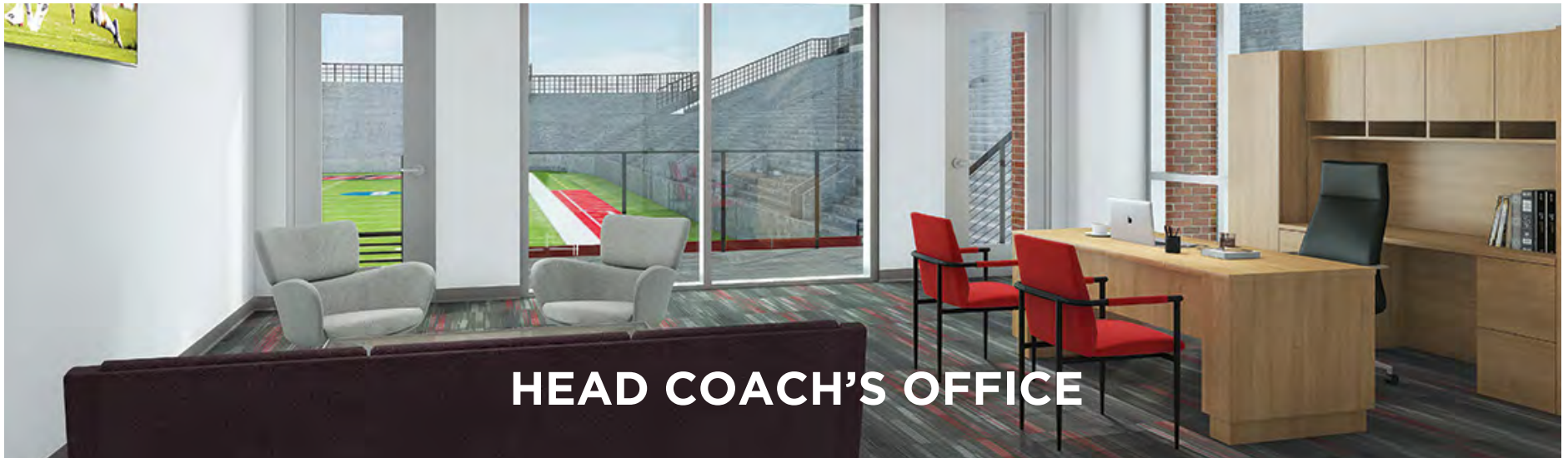
HEAD COACH'S OFFICE