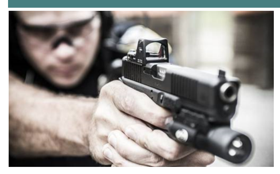
FIDC 2 - Coaching Red Dot Sights on Pistols

This course is designed to improve a firearms instructor's ability to coach new and veteran shooters in the use