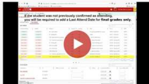
Financial Aid Requirement for Grade Entry