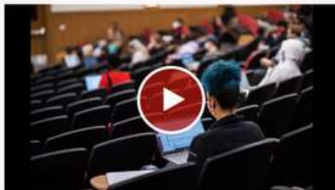
Faculty Grade Entry