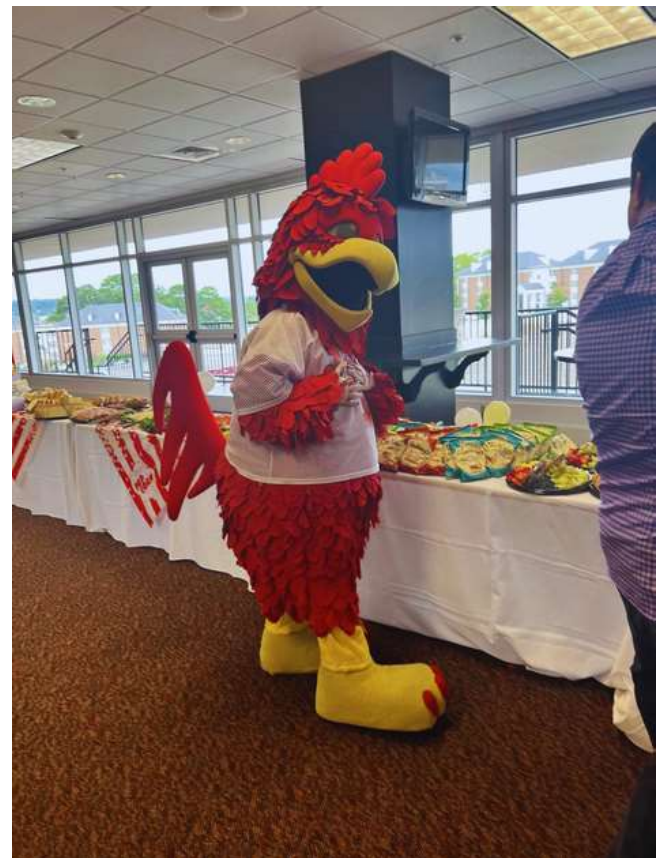
Cocky Enjoying Lunch