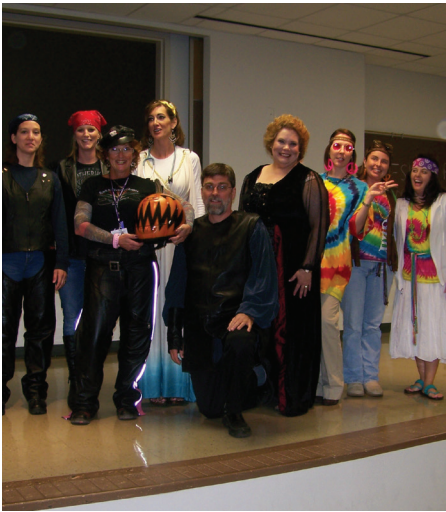
JSU faculty and students enjoy Halloween fun in the 2012 Fall-In event. This annual event provides fall mid-term fun for faculty and students alike.