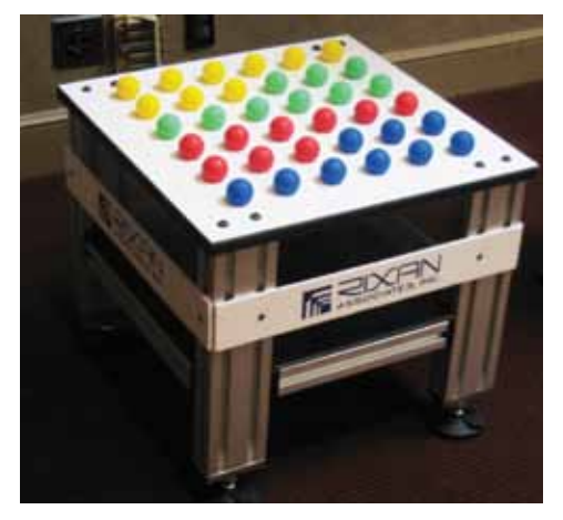
The Target built by Rixan Associates

...the team from JSU built their robot, nicknamed Ol' Janky, Jr. from scratch.