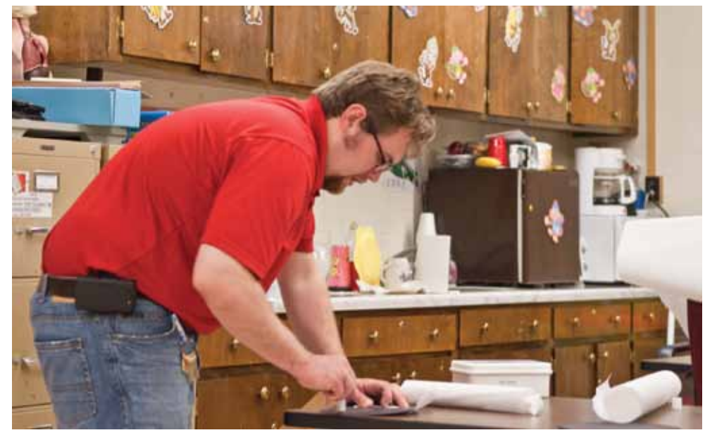
JSU College of Education and Professional Studies Passport to Success 2011

Part of the instruction involved training in the use of and production of educational software. The lab was a licensed copy site for the Minnesota Educational Computing Consortium (MECC) and the Alabama Educational